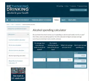
Alcohol Spending Calculator link